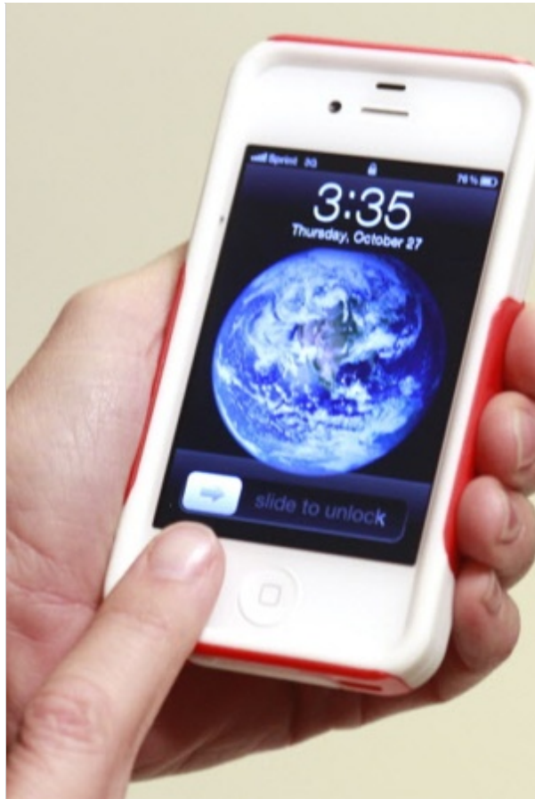
APPLE IPHONE Swoosh to the right.

technology joins other touch-screen patents Apple holds, some of which are the subject of lawsuits that the Silicon Valley juggernaut has brought against its competitors HTC, Samsung, and Motorola, whose handhelds run Google's Android operating system.